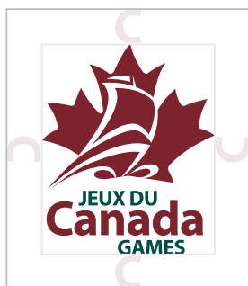
MINIMUM CLEAR SPACE "C" FROM "CANADA"