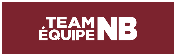
SOLID DARK BACKGROUND