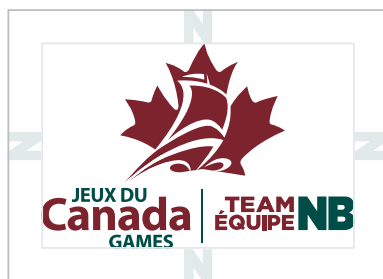
MINIMUM CLEAR SPACE "N" FROM "NB"