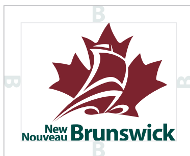
MINIMUM CLEAR SPACE "B" FROM "BRUNSWICK"