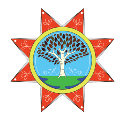
A'fis ujit l'nueyey kina'matmkewey

Litposuwakon'Ciw Skicinuwi-Kehkiketuwakon