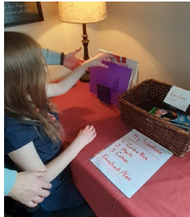
Partial Physical Assistance