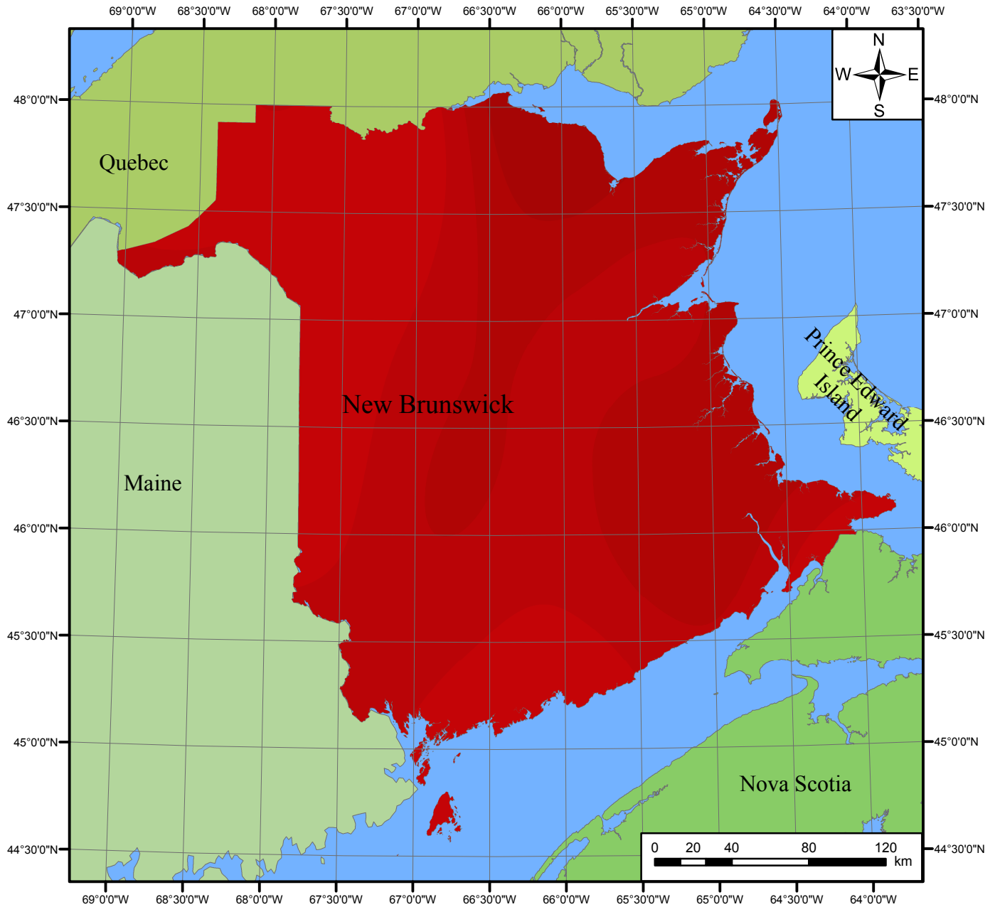
Mean Daily Global Insolation (Horizontal Surface)