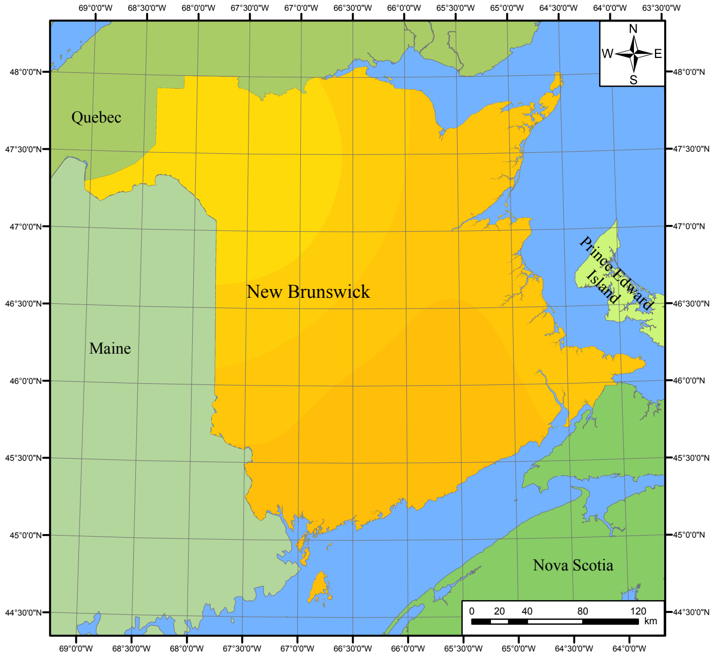
Mean Daily Global Insolation (Horizontal Surface)