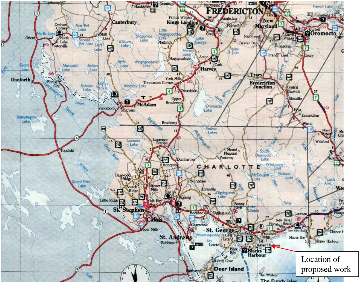
Figure 1. Map indicating proposed project site in relation to surrounding communities.