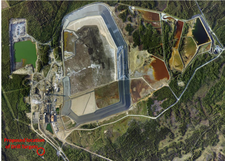
Figure 1: Aerial Photo of the Brunswick Mine Site (PID 20172953)

Plan to drill wells in the South West edge of the property, as marked on Figure 1 below.