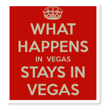
Chatham House Rule applies