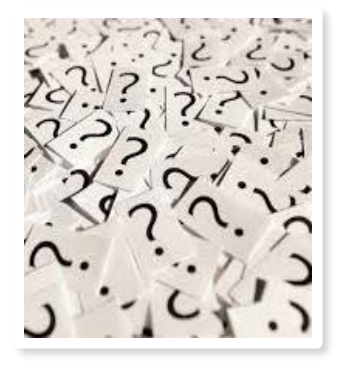
There are no 'bad' questions